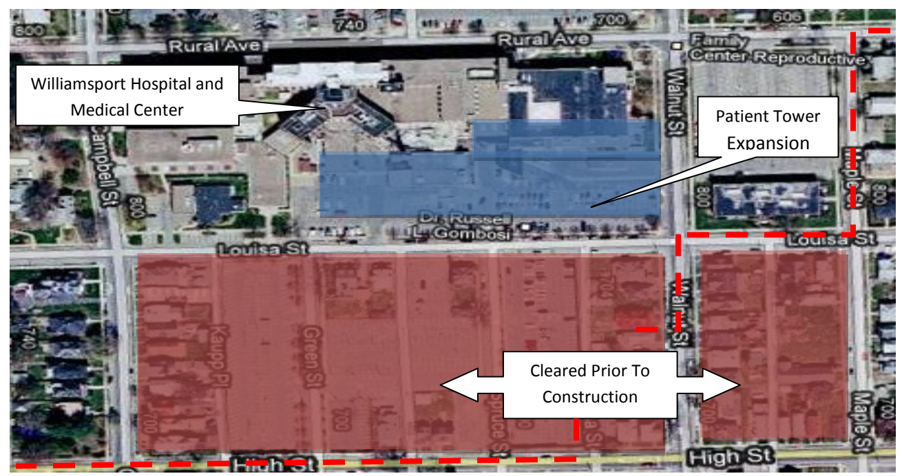
Figure 2 Construction Traffic